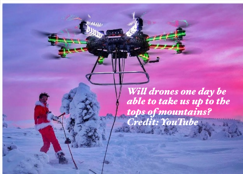
Will drones one day be able to take us up to the tops of mountains?

I look forward to seeing you at the RSC social as well as the skiing events. Here's to a great ski year!