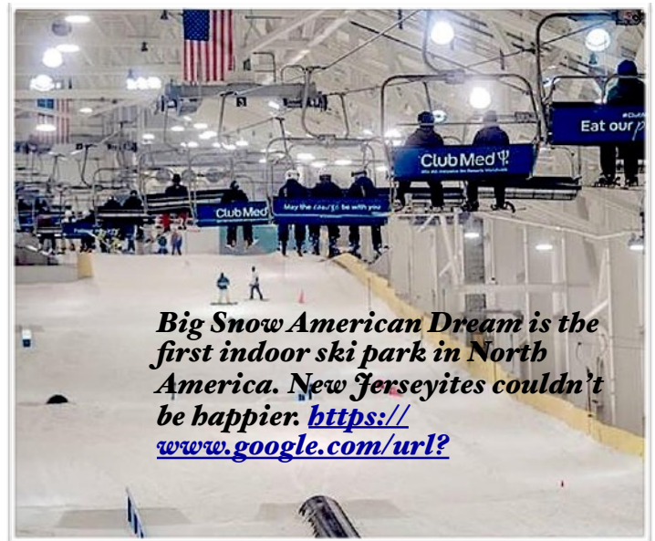
Big Snow American Dream is the first indoor ski park in North America. New Jerseyites couldn't be happier. https://www.google.com/url?