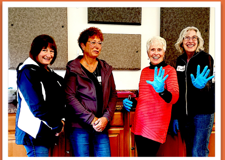
RSC gathers to talk and eat a lot at October BBQ.