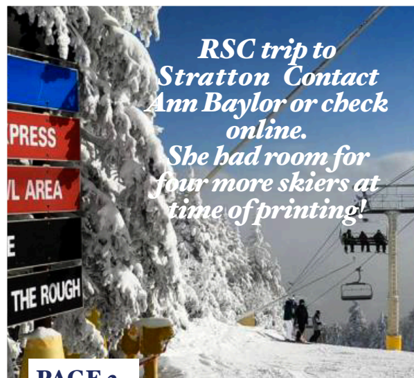
RSC trip to Stratton Contact Ann Baylor or check online. She had room for four more skiers at time of printing!