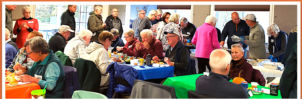
So much to eat, they ended up taking some home.

Event flyers and information regarding all club activities available through the club website: www.rochesternyskiclub.com