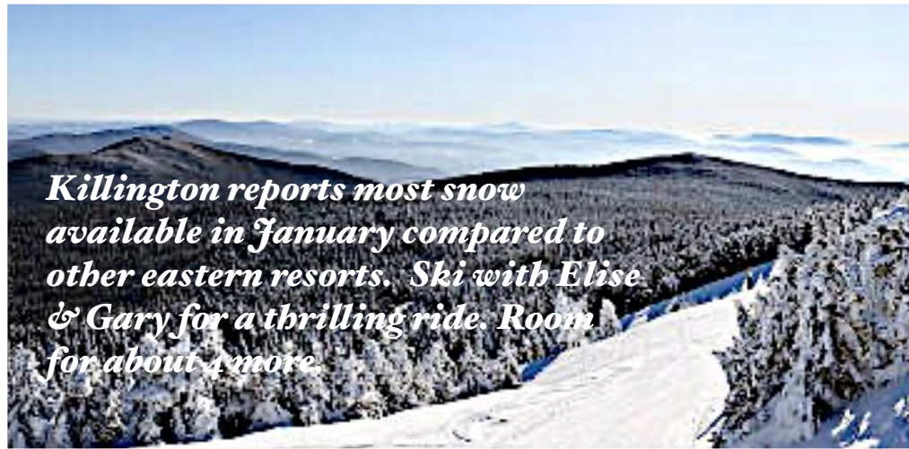
Killington reports most snow available in January compared to other eastern resorts. Ski with Elise & Gary for a thrilling ride. Room for about 4 more.

Second, all of our trips are deployed through RSC's new operating system (WildApricot) for registration and payment of a trip. However, the procedures of the past, paying by check rather than credit card, are still available. Again, instructions for registering and paying are included in the flyers for each trip. Please note that RSC membership is a requirement for participation in all RSC ski trips. With the exception of Sunday River there is still space available on all four trips, but immediate action is required in order to get registered.